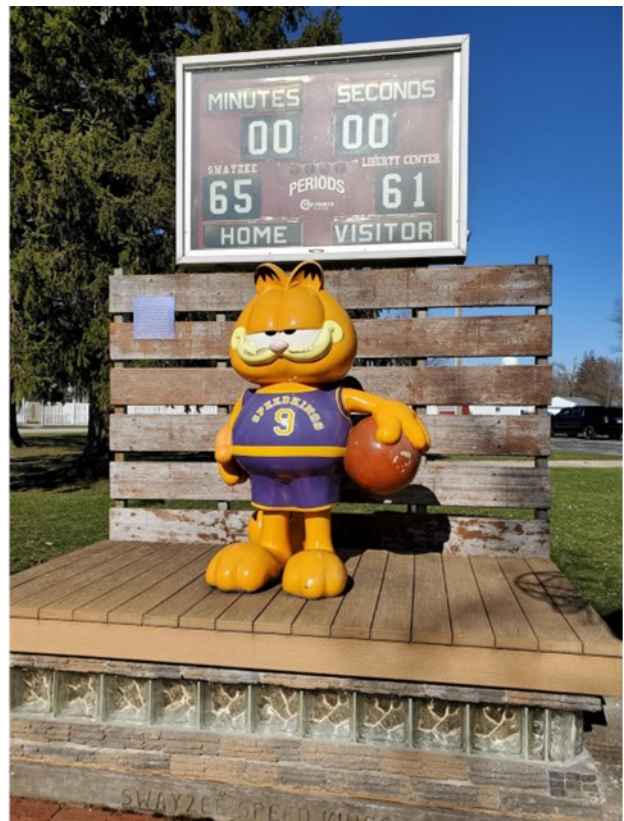
This Garfield statue honors the Swayzee [Indiana] Speedkings, 1964 High School Regional Camps & State record holder with 9 overtimes in one game. (Dedicated June, 2008)