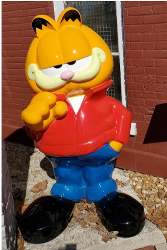
This Garfield statue is dressed in honor of his fellow Fairmount [Indiana] native, 1950’s film star, James Dean. (Dedicated July, 2008)

For more specific information on the precise locations, visit: https://www.onlyinyourstate.com/indiana/garfield-trail-in/